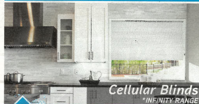
Cellular Blinds *INFINITY RANGE