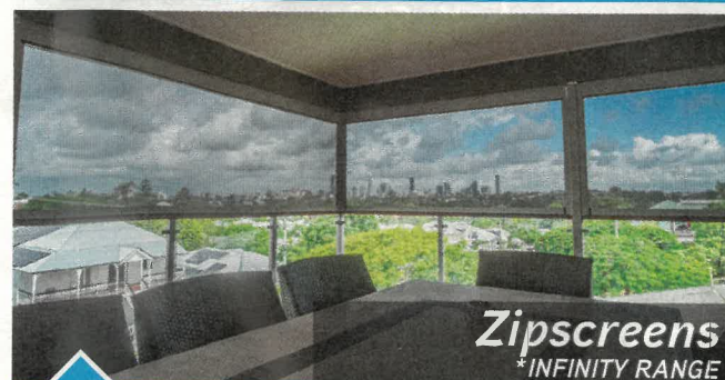
Zipscreens *INFINITY RANGE